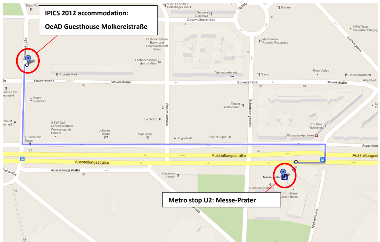
Map 1: metro - accommodation

The Vienna International Airport (VIE) in Schwechat is about 20 km away in the southeast of Vienna. Train lines S7 and S2 connect the city center with the airport. You need a single ticket for two zones (4 Euro) between the airport and any place in the city. To go from the airport to the accommodation of IPICS 2012 take the line S7 in direction Floridsdorf . Get off at Praterstern and take the metro U2 (purple line) in direction Aspernstraße . Get off at the first stop at Messe-Prater (see map 1).